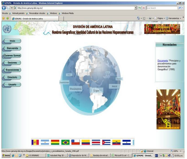
Homepage of the Latin America Division - <a href="http://www.genung-dal.org.mx">http://www.genung-dal.org.mx</a>.