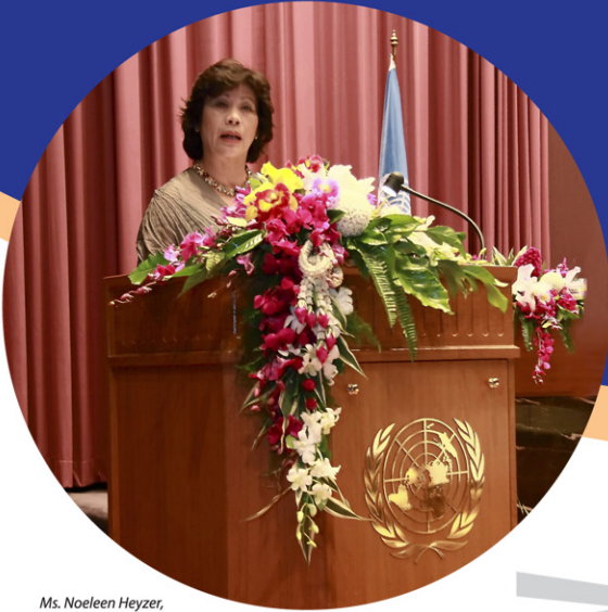
Ms. Noeleen Heyzer, UN Under-Secretary-General and Executive Secretary of ESCAP, addressing staff and guests during celebration of United Nations Day 2008 at ESCAP Hall, UNCC

On historic Rajadamnern Nok Avenue of Bangkok, there are many prominent landmarks. One of them is a group of contemporary buildings called the UN compound, which serves as the headquarters of the United Nations Economic and Social Commission for Asia and the Pacific. Facing the historic Makkhawan Rangsan Bridge stands the United Nations Conference Centre (UNCC). Designed by renowned Thai architect M.L.Tri Devakul, the UNCC has become the centerpiece of the three UN buildings after it was inaugurated by His Majesty the King of Thailand in the presence of then Secretary-General of the United Nations in April 1993.