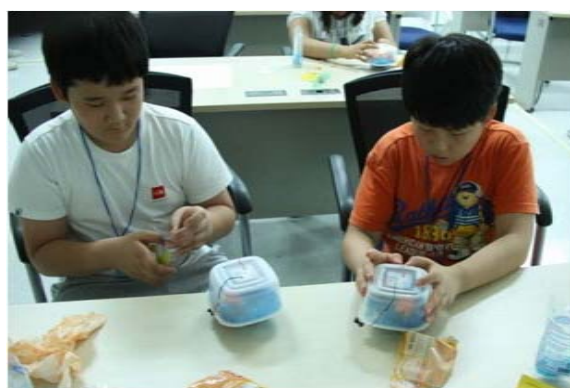
Marine Summer Camp Program for Primary School Students