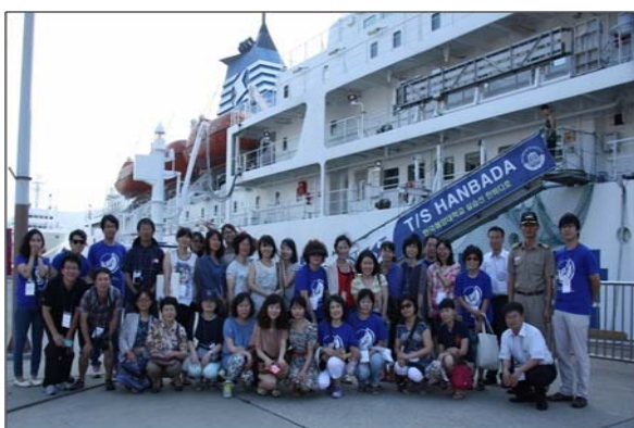
Training Program for Primary and Secondary School Teachers

A marine summer camp programme was offered for primary school students in Busan to increase their understanding and interest of marine geographical names and the oceans. The participating students had opportunities to obtain general knowledge and information about the oceans through various activities.