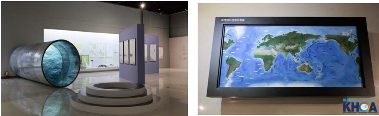
Figure 3. Exhibition on Marine Geographical Names

KHOA hosted a month-long exhibition on marine geographical names titled “Oceans, Earn Names and Fame” from October 30 to November 30, 2013. The exhibition was divided into four sections: ‘Wider Look of the Ocean,’ ‘Closer Look into the Ocean,’ ‘Oceans, Earn Korean Names and Fame,’ and ‘Our Magnificent Seas.’ The exhibition provided comprehensive information on marine geographical names utilizing various techniques to foster a general understanding of marine geographical names. In particular, the significance of this exhibition lay in that it moved away from a dry information-focused exhibition and explored the marine geographical feature names with artistic perspectives. Artistic works were created offering new perspectives on marine geography and marine geographical names.