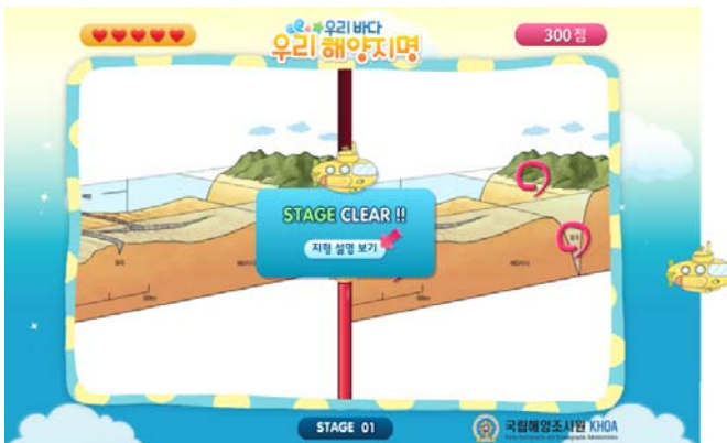
Web-based Game Page

The webtoon on marine geographical names consists of five chapters. Various diagrams and pictures featured in the webtoon provide easy-to-understand explanations which help readers understand the terms and registration procedures. The webtoon is available in both Korean and in English so that the international community can utilize it as a learning tool.