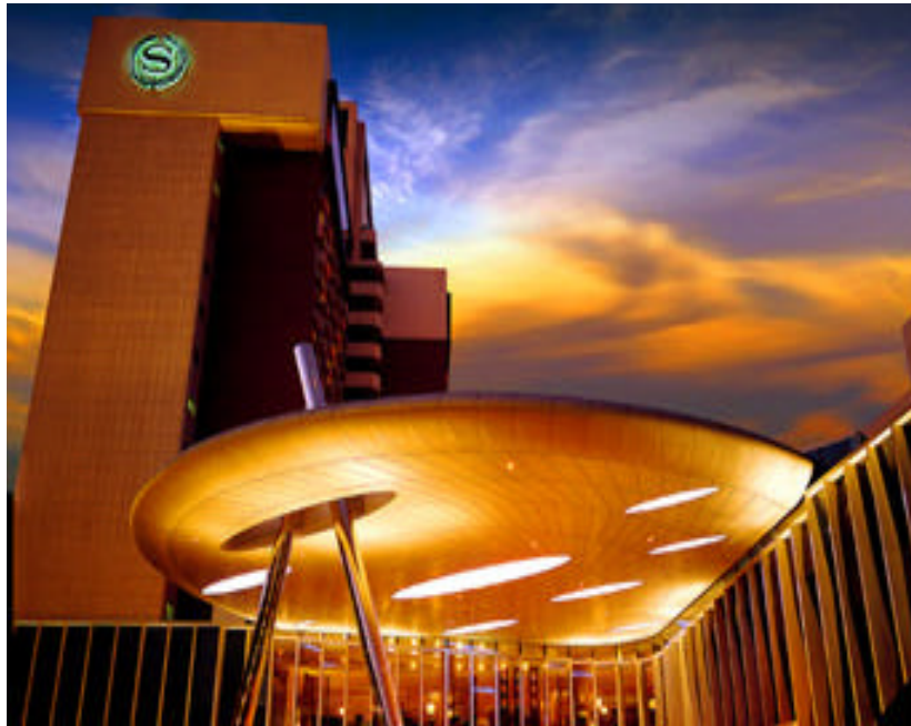
Sheraton Grande Walkerhill Hotel Seoul

Sheraton Grande Walkerhill Hotel Seoul is in the northeast of Seoul, 100 minutes away from Incheon International Airport and 20 minutes from downtown, shopping and financial centers. It is efficiently serviced by shuttle buses, taxis and the subway. Room facilities include alarm clock, mini bar, non-smoking rooms, free newspaper, safe deposit box, TV, air conditioning, direct dial telephone, private bathroom, internet access.