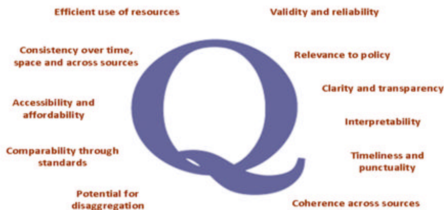
Figure 2. Dimensions of data quality

6. Addressing policy and decision-making needs in timely and accurate fashion is a sine qua non of official statistics in general and social statistics in particular, given a host of social issues that are a specific concern of policy makers at all levels. The pressure from policy makers in terms of their needs for monitoring and quantifying social phenomena needs to be anticipated well in advance if meeting these needs is to be successfully achieved. Thus, there is a need to monitor the substantial development in many different social areas.