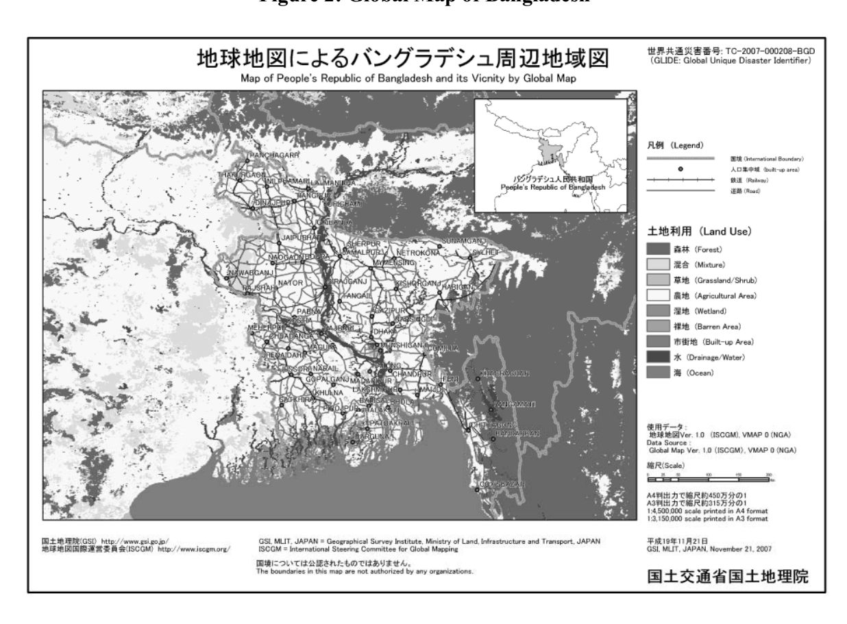
Figure 2: Global Map of Bangladesh

on December 24, 2004 (Ubukawa, Kisanuki, Akatasuka, 2008). The Geographical Survey Institute of Japan released a regional map of the affected area using Global Map data within days of the disaster. The base map data of the eight layers of Global Map is particularly useful when more than one nation is affected by a disaster. The common specifications and standards and the ready online availability of Global Map provides a useful small scale framework to which other information can readily be added. Global Map is an operational global spatial data infrastructure (Taylor, 2005). Since 2004 Global Map has released maps for use in disaster mitigation for all major disasters which have taken place since that time and these are now released within 48 hours of the occurrence of a disaster (See Table1). Figure 2 shows one of the maps released after the cyclone in Bangladesh in 2007.