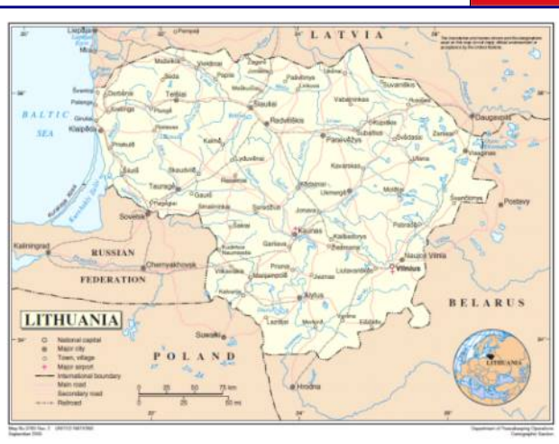
Note: The boundaries, the names shown, and the designations used on this map do not imply official endorsement or acceptance by the United Nations.