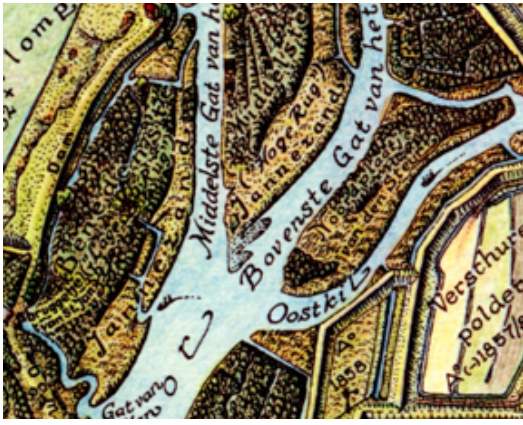
From a commercial map of the same area, 1960